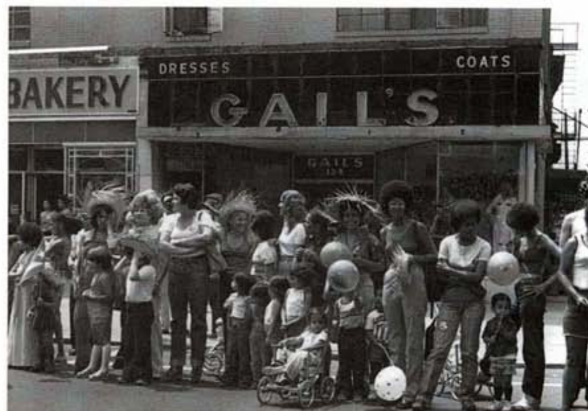
Gathering to watch the Puerto Rican parade, 134 Washington Street, June 1975.

Hoboken was the Mecca for Puerto Ricans in New Jersey. When we moved here, like I said, we were one of the first families here in