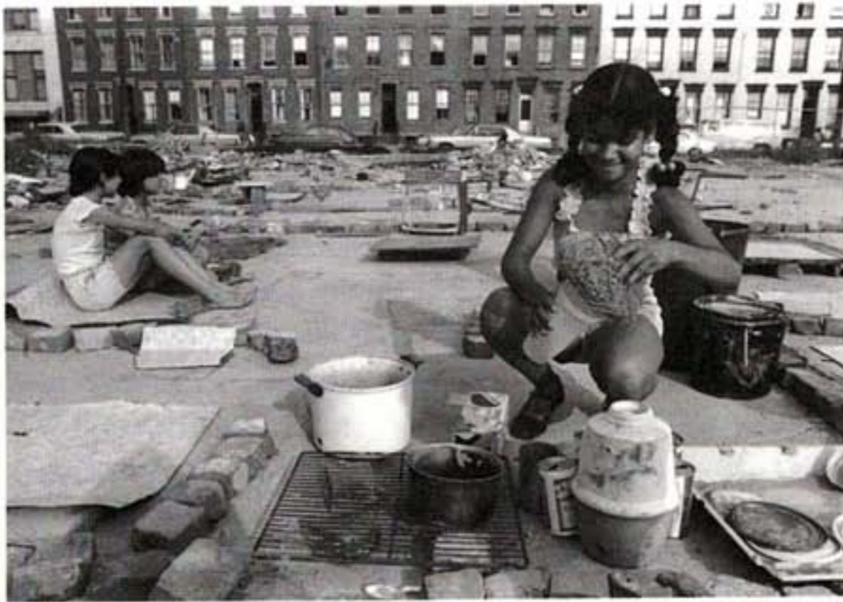
Playing house in a Hoboken lot, Observer Highway between Bloomfield and Garden Streets, 1975.

blamed on the residents. But the truth of the matter was, it was a combination of factors. When you have a building or you have an area, and you rent to people without doing any background check, without really checking out the tenant who's coming in, you're going to have problems. And when you allow the building to deteriorate, where violations exist but there is a need for people to rent an apartment, some people will go in there. Nothing is done, but people are willing to go in there because the rents are cheap. But then you may get a tenant who may not be a good tenant. So it's a combination of the landlord allowing the building to deteriorate, not doing a background check, so, of course the neighborhood is run down and everything is ultimately blamed on the resident. The landlord is also to blame. As a tenant advocate in later years, I saw that even more. To this day, three months ago, I saw that on Washington Street, in