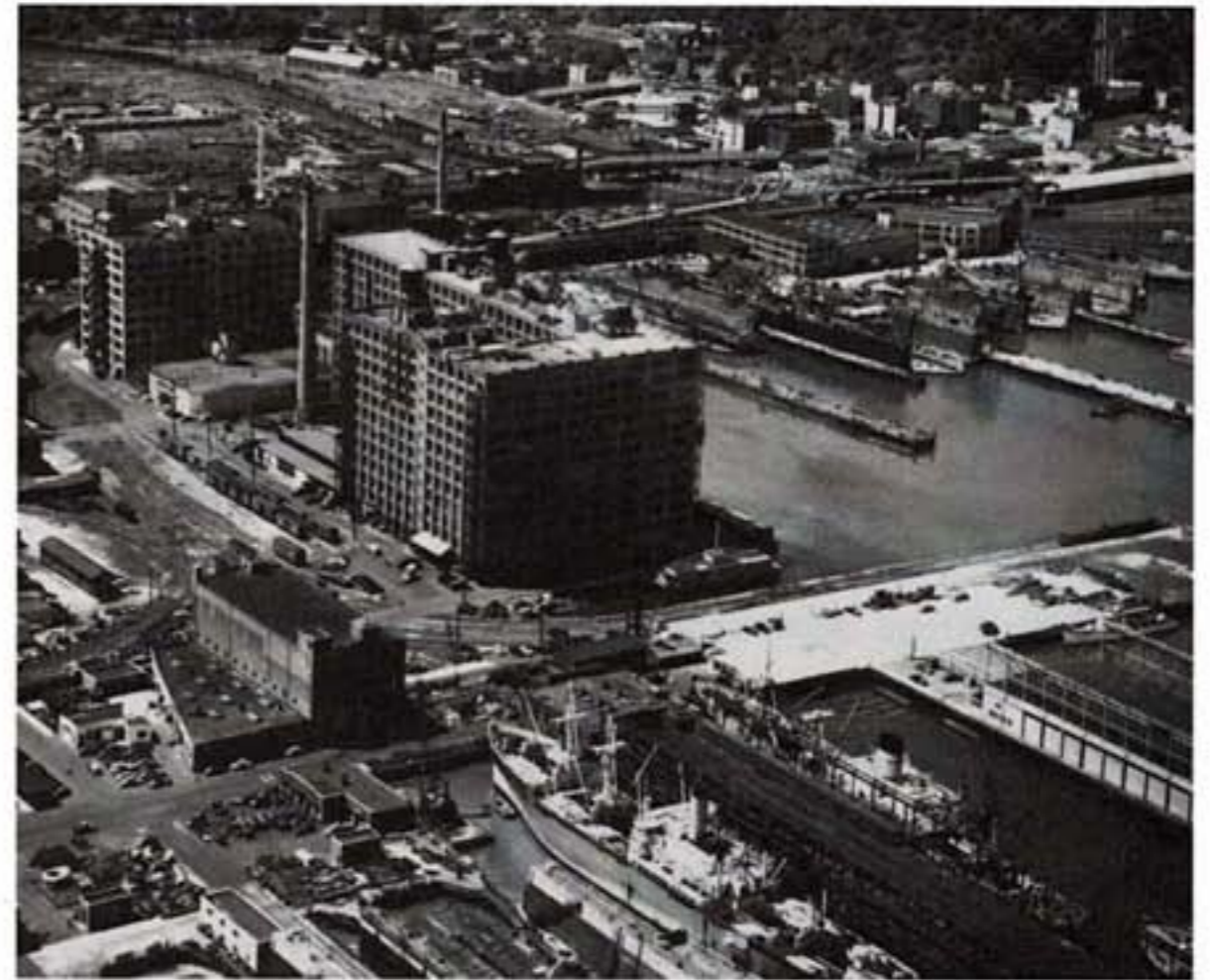
A partial aerial view of Hoboken industries and its working waterfront, 15th and Washington Streets, looking northwest, 1951, Fairchild Aerial Surveys. The foreground shows Todd Shipyards. The large structure is the Standard Brands building (Lipton Tea). COURTESY OF THE NEW JERSEY STATE ARCHIVES, DEPARTMENT OF STATE

Hoboken at that time was a very industrial town. It had a lot of factories that dealt with garments, principally, women's clothes. That was a big thing. [And there was] big industry here, where a lot of the people who lived here, worked here. Not only garments. You