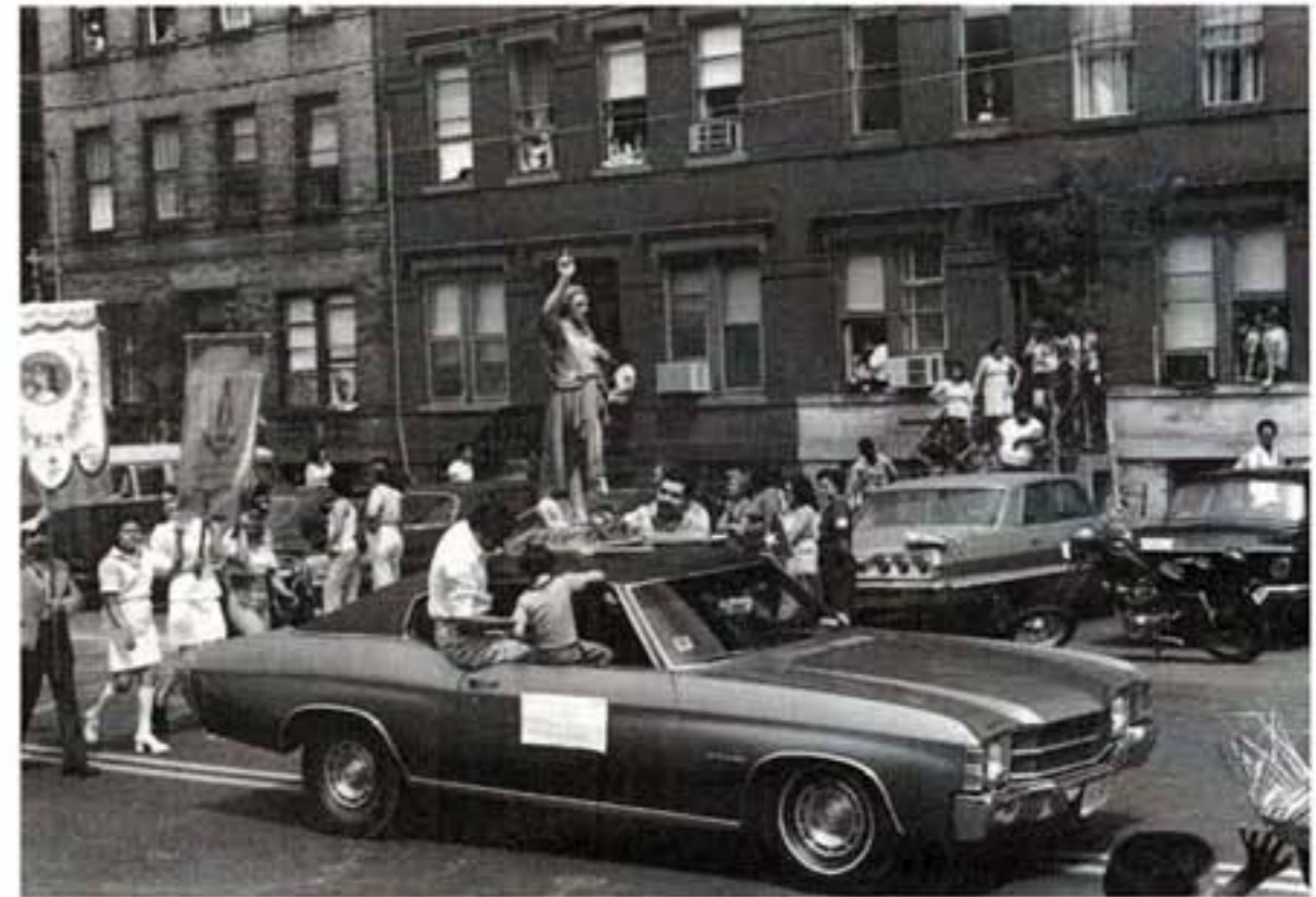
Saints procession, Puerto Rican parade, Washington Street, June 1975.

My mother had a lot of adopted grandchildren, in that sense. When my mother passed away, you wouldn’t believe the people who showed up to see her. She had raised them. These are kids who see me as a brother or an uncle. And during those days it was really a family-oriented neighborhood.