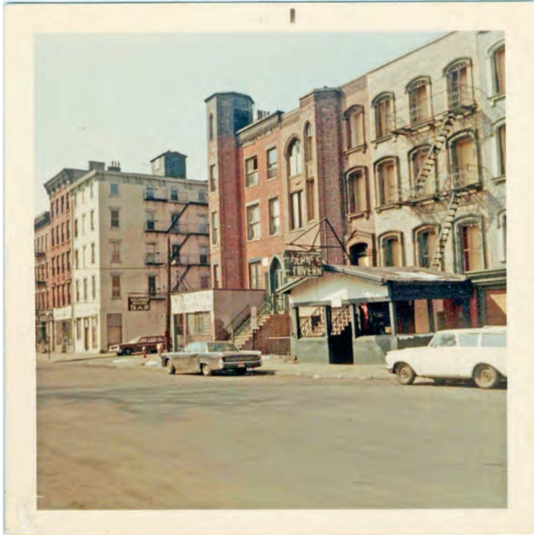
Photo of River Street, between Third and Fourth Streets, Hoboken, prior to demolition, 1969. A sign for Nelson's Marine Bar & Grill can be seen on the left; Keane's Tavern is in the center.

I went there, [to Nelson's, but] I didn't drink that much. In fact, I didn't drink alcohol at all until I was in my thirties. Like even in the Army, I didn't drink or smoke. I just didn't. But my brother did: the first thing, he would wake up and his feet were on the floor, a cigarette in his mouth.