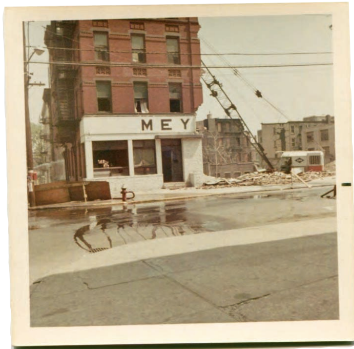
Meyer's Hotel, on the corner of Hudson and Third, was also demolished in 1969.