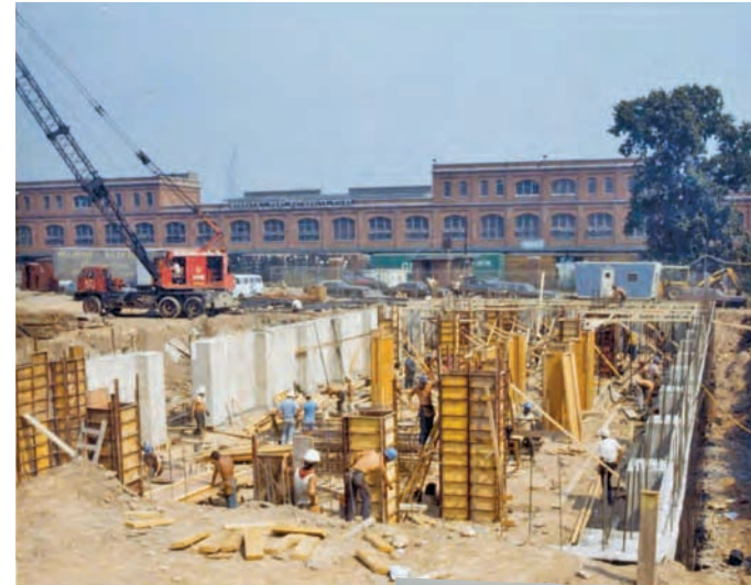
Building the foundation for Two Marine View Towers, Port Authority Piers (since demolished) in the background, ca. 1973.