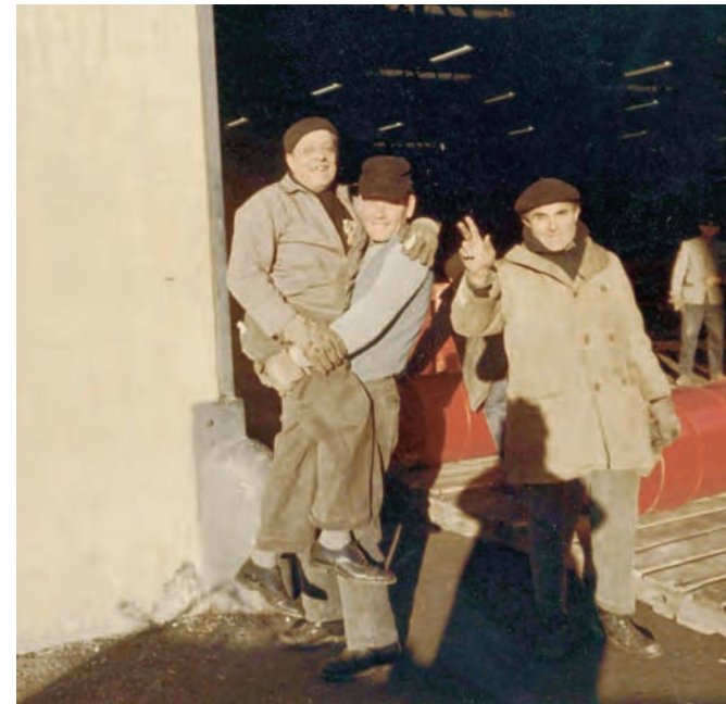
Some longshoremen horsing around for the camera, Pier C, Hoboken, ca. 1965.