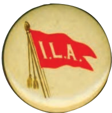
International Longshoremen's Association pin, ca. 1950.

You had the deck gang and you had the hold gang. There were seven men in a gang. [The hardest work] was in the hold.