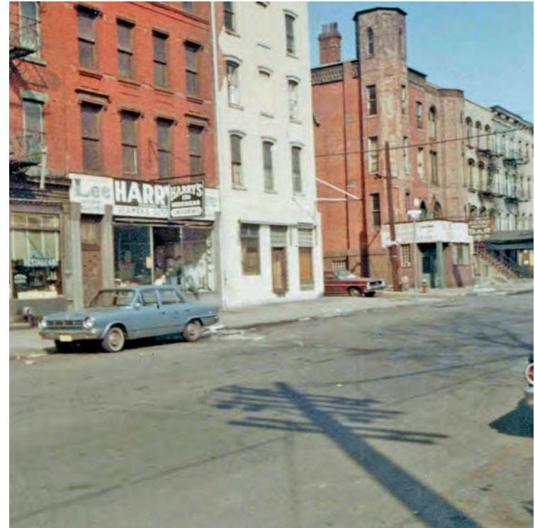
Harry's, 230 River Street, Hoboken, sold menswear, work clothes, uniforms, and was an outfitter for seamen.

The demolition didn't bother me at all. No. (Laughs.) There's no tears.