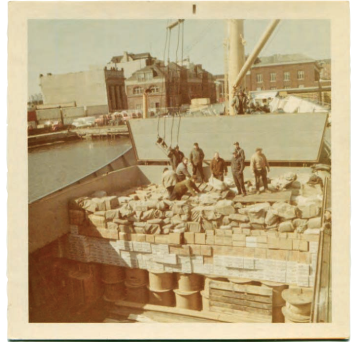
Photo of long-shoremen loading up a ship on the south side of Port Authority Pier 3 (now Pier A), ca. 1965. A "checker" is listing what has been loaded, including bags of mail, which must go on top.

Below: Unloading barrels from a ship's hold, ca. 1969.