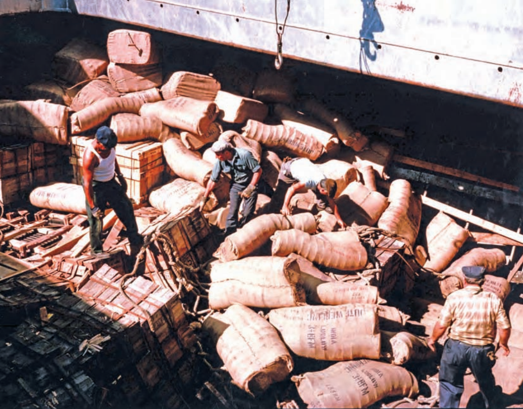
Hold gang with hooks unloading crates, boxes, and bags of Indian jute from a ship hold, ca. 1969.

In Hoboken, I worked on Pier C. I think most of the guys lived in Hoboken.