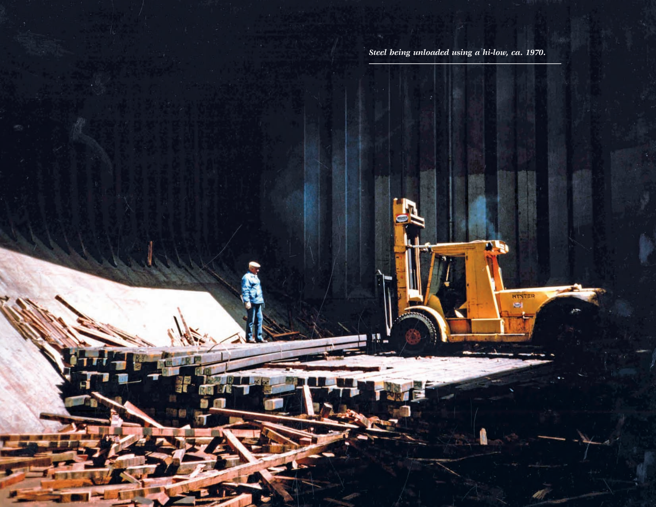
Steel being unloaded using a hi-low, ca. 1970.