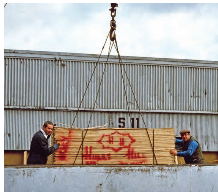
Loading plywood from the dock to the hold, to use to separate cargo, ca. 1970.

[On Pier C, there would be a mix of stuff to unload.] Pallets. Rolls of paper. Steel, which was rolled. A big hi-low, that had a metal thumb, went into the roller and then pulled it out. And then we just hooked it up.