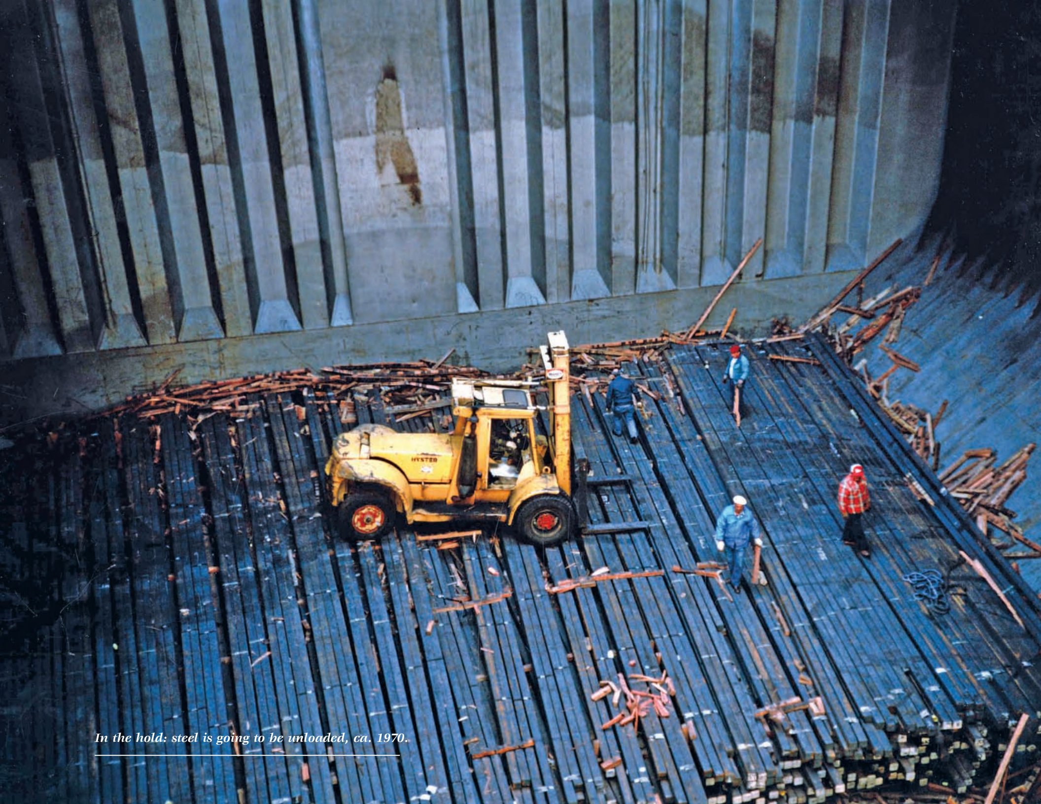
In the hold: steel is going to be unloaded, ca. 1970.