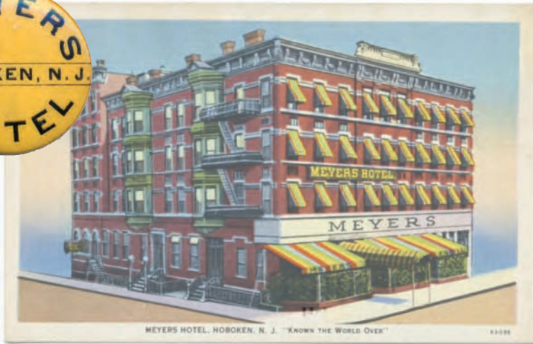
Advertising pin for Meyer's Hotel, ca. 1895-1910. Hoboken Historical Museum collection. And, postcard of Meyer's Hotel, Hoboken, N.J. "Known the World Over," ca. 1930. Established at the end of the 19th century, Meyer's welcomed travelers and hosted community events and weddings for more than 70 years.