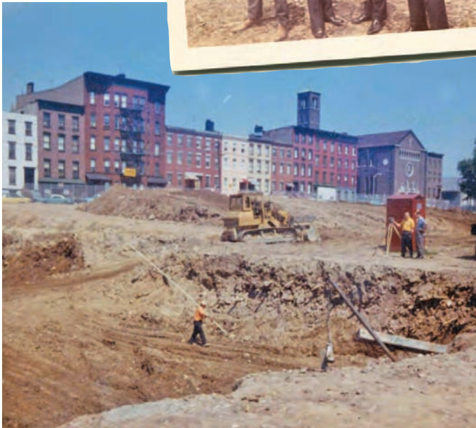
Preparing for the construction of Marine View Towers, Hudson and Fourth Streets, ca. 1973.