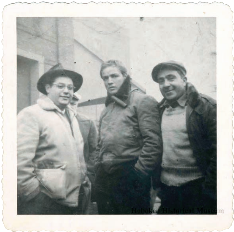
Hoboken Historical Museum

[What do I think when I see On the Waterfront?] I enjoy it. I recognize a lot of the guys that were in that movie.