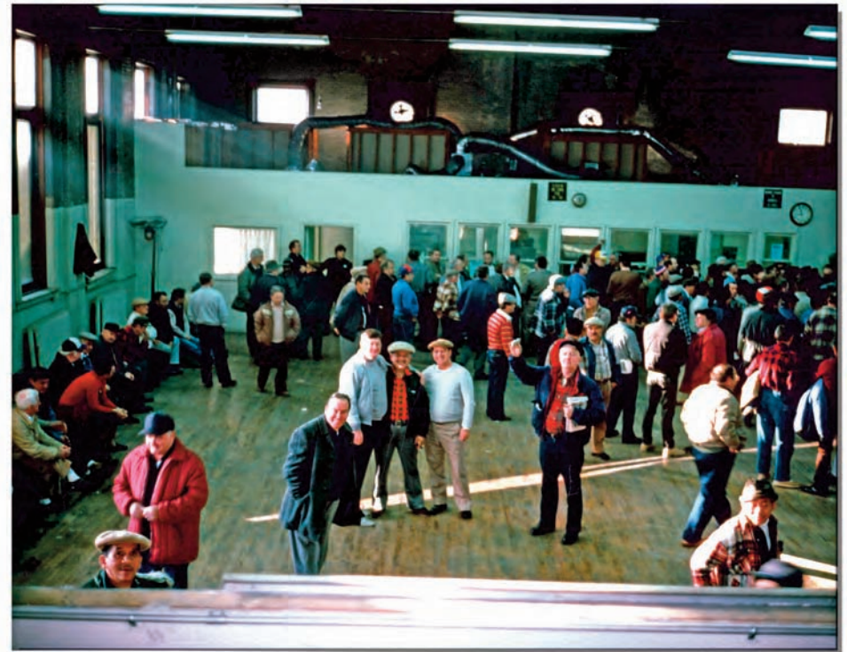
The hiring hall for the International Longshoremen's Association was on the top floor of Hoboken's City Hall for many years. Photo ca. 1970.

[And the reel-to-reel tape recorder?] I don't have that anymore. The thing was for me, but I told the owners [of the Shannon and other bars] I had music on reel-to-reel, and they let me play it there—the old time songs—and people sang along.