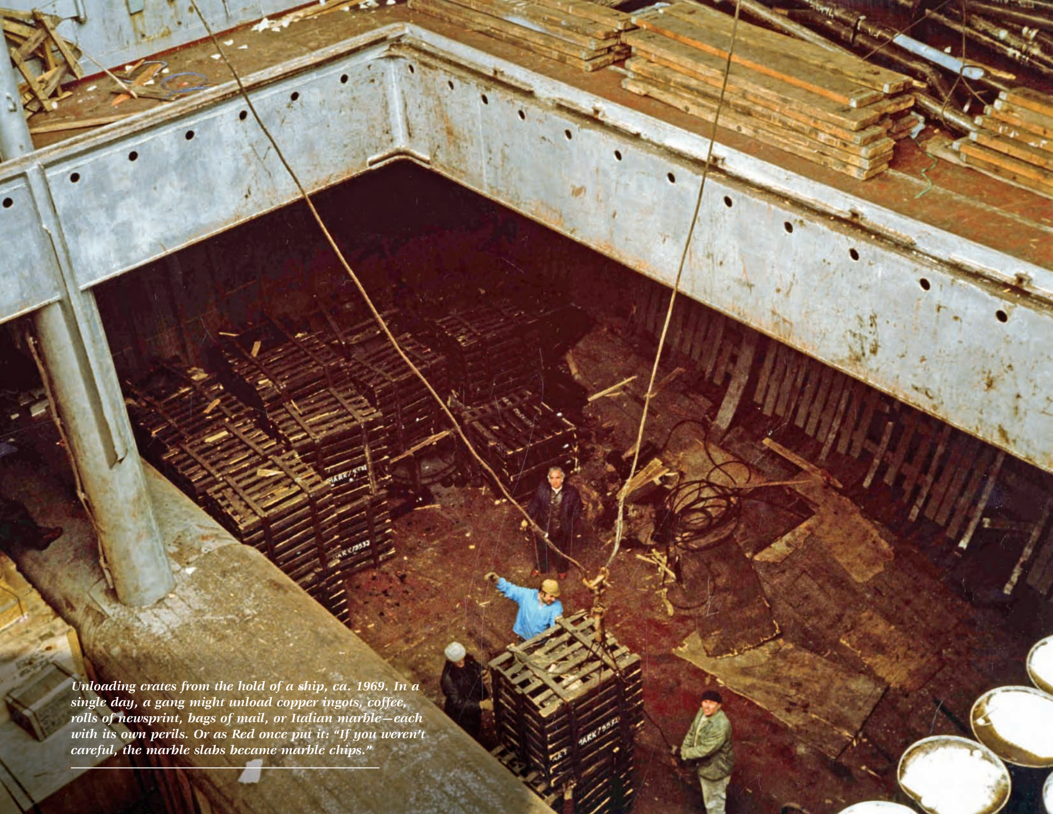
Unloading crates from the hold of a ship, ca. 1969. In a single day, a gang might unload copper ingots, coffee, rolls of newsprint, bags of mail, or Italian marble—each with its own perils. Or as Red once put it: “If you weren’t careful, the marble slabs became marble chips.”