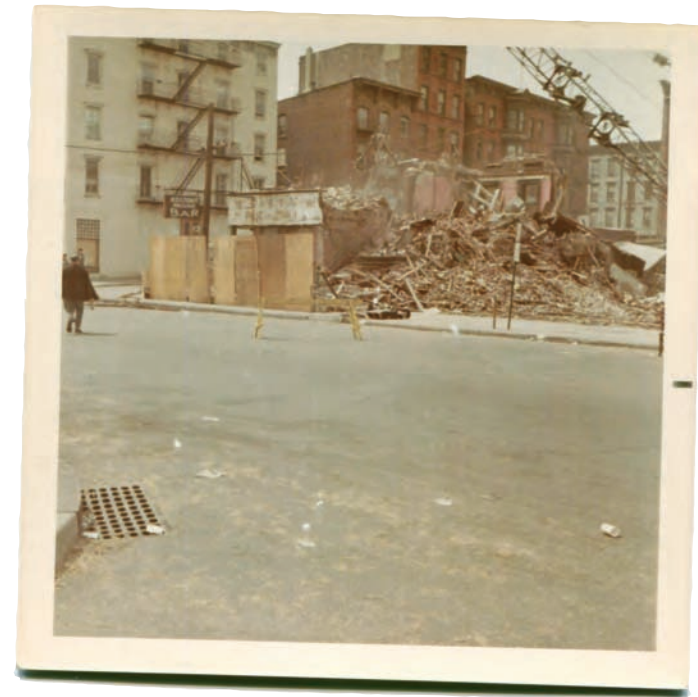
Photo of the demolition of Nelson's Marine Bar & Grill, 1969.