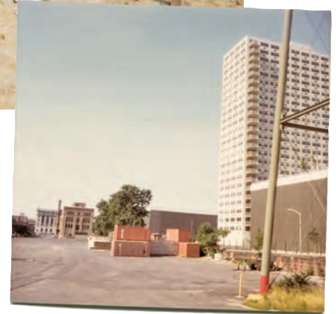
Marine View Towers, ca. 1974.