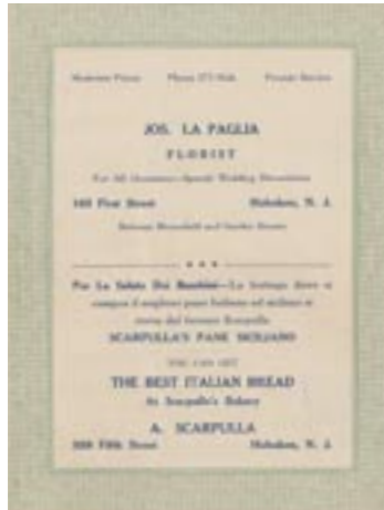
Page from a souvenir program for the Ninth Annual Cabaret and Ball of the Little Tommie and Charles Monto Association, 1923, including an advertisement for Scarpulla's Pane Siciliano, 559 Fifth Street, Hoboken.